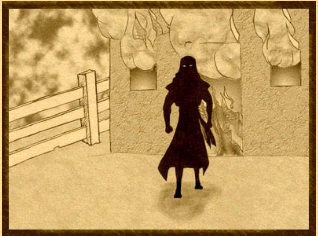
An unknown assailant leaves the scene of a burning building.

Also destroyed in the attack was a House Cannith logging facility. Mycroft d'Cannith of the Sharn Fabricator's Guild has already contracted the House Charashk Finder's Guild to investigate the attack and bring to justice those involved. d'Cannith, when questioned about the warrant, made the following