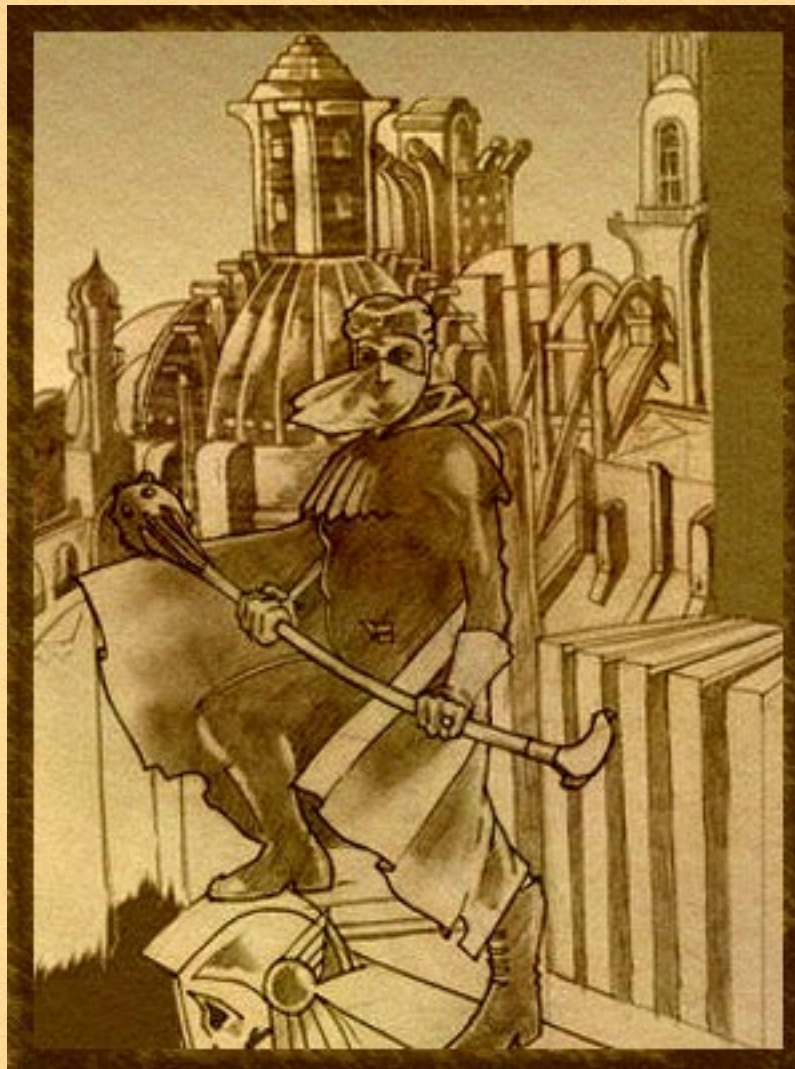
Staff artist rendering of the Dark Defender of Sharn.

that the satchel appeared out of nowhere, accompanied by a passing chill in the air. The following note was bound to the satchel, written on the skin of a Displacer Beast:—