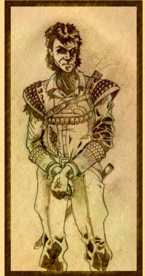
Vangradaun the Black.

Initial reports from the northern foothills of The Blackcaps reveal that a large force of men has been slaugh-